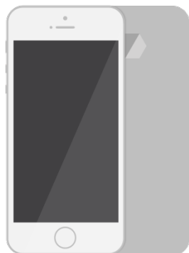
Figure 1 IP phone

Today's smartphones are protected by over 1000 patents , including for their semiconductors, cameras, screens, batteries and calendars.